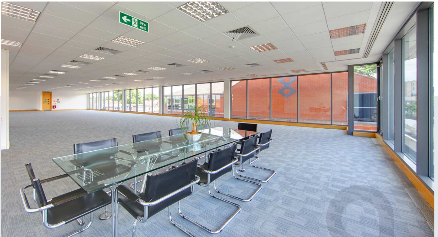
Second floor image is indicative of the first floor