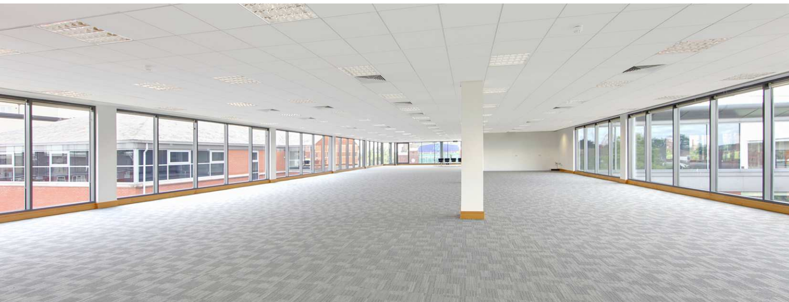
Second floor image is indicative of the first floor